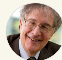
DR. HOWARD GARDNER Harvard Graduate School of Education

"Design for Change (DFC) is one of the most exciting and important educational programs that I know of, with the potential for impact in numerous countries around the globe....Our first wave of studies documents clear improvements in student empathy as well as challenges in enhancing problem solving abilities....DFC provides a valuable model for a wide range of educational innovations'.